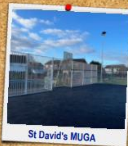
St David's MUGA

The MUGA project was funded from a developer's financial contribution (Section 106 funding) that was to be used solely for outdoor sport in the village. The fully inclusive Multi Use Games Area (MUGA) provides for a variety of sports including tennis, netball, 3x3 basketball and football. Brand new LED floodlights will allow the MUGA to be used all year round by local residents.