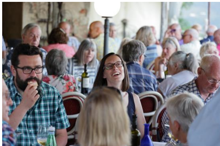
The Singers in Tuscany

Unique in their practice arrangements, the choir meets for a weekend of intensive singing just once a month and includes members living as far afield as Shropshire, Oxford, London and, yes, Northamptonshire! The singers are of all ages and represent many interests, musical backgrounds and walks of life, and have